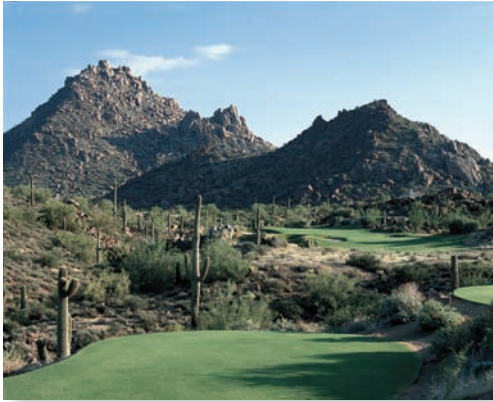
In the late 1990s, the city of Scottsdale, Ariz., mandated that Troon G&CC and other courses in the city begin irrigating with recycled water.

a pond of potable water. Local laws may require the use of liners for lakes converted for storage of recycled water to prevent potential groundwater contamination.