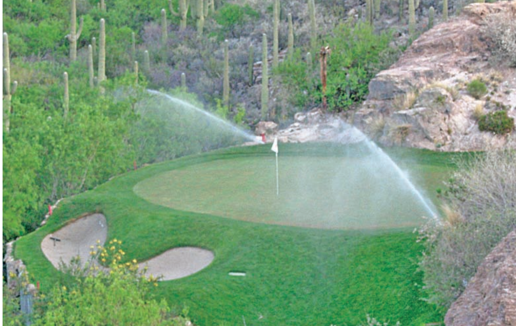
Along with many other golf courses in the United States, Ventana Canyon Golf & Racquet Club in Tucson, Ariz., irrigates with recycled water.

suitable for limited reuse, including irrigation. Recycled water is also referred to as reclaimed water, wastewater, effluent water, treated effluent water and treated sewage water. In this document, the term recycled water will be used.